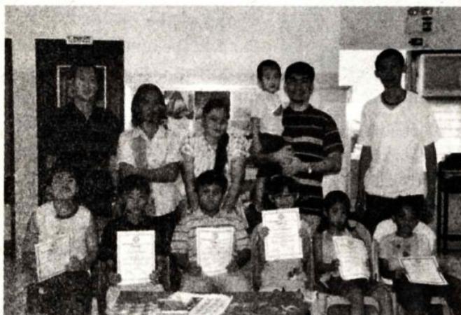
Our Cebu Lodge 128 brethren and beneficiaries

T hese projects include the publication of its official newsletter, Ebbs and Flows ; the holding of an art workshop for children aged 6 to 12; the conduct of "Operation Manhood" at the South General Hospital in Naga City, Cebu, which benefited more than 200 boys; donation of various medicines to the Philippine Coast Guard Auxiliary Group to augment its medicine supply for better service to the community; giving school supplies to students of Barangay Kalunasan Elementary School in Cebu City, as well as lesson plan books and teaching aids to teachers; and teaching residents of Asturias, a municipality south of Cebu City, some basic "pang-negosyo" lessons, conducting among youngsters a simple yet unique job matching for possible employment opportunities in the city, and carrying out a medical mission, which resulted in several kids undergoing cleft lip operation, some women being treated for their goiter, and a few males for hernia surgery, and several oldies undergoing cataract operation.