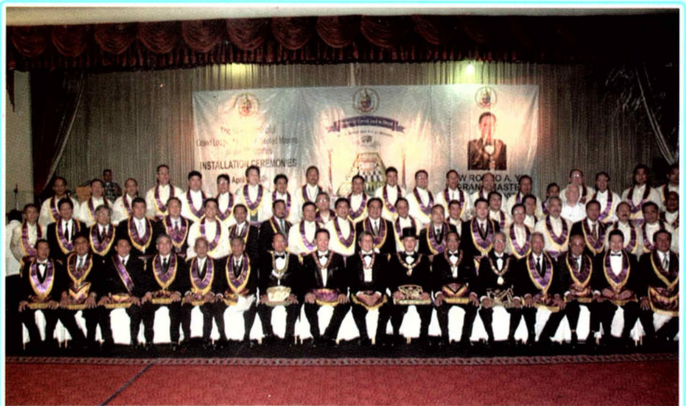
Elected and Appointed Grand Lodge Officers