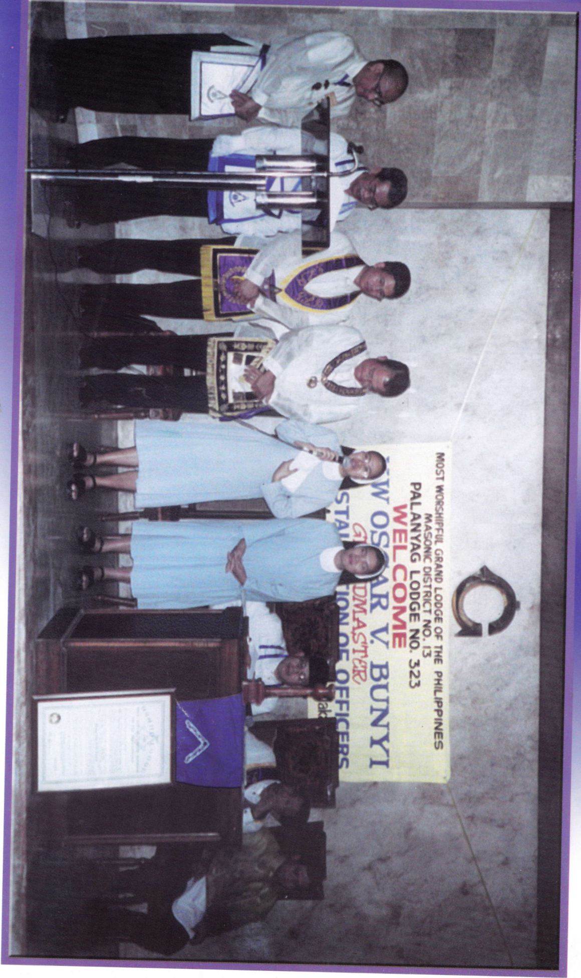
Palanyag Lodge No. 323 donating to the Sisters of the Servant of Mary P50,000.00, MW Bunyi with visiting Grand Lodge dignitaries.