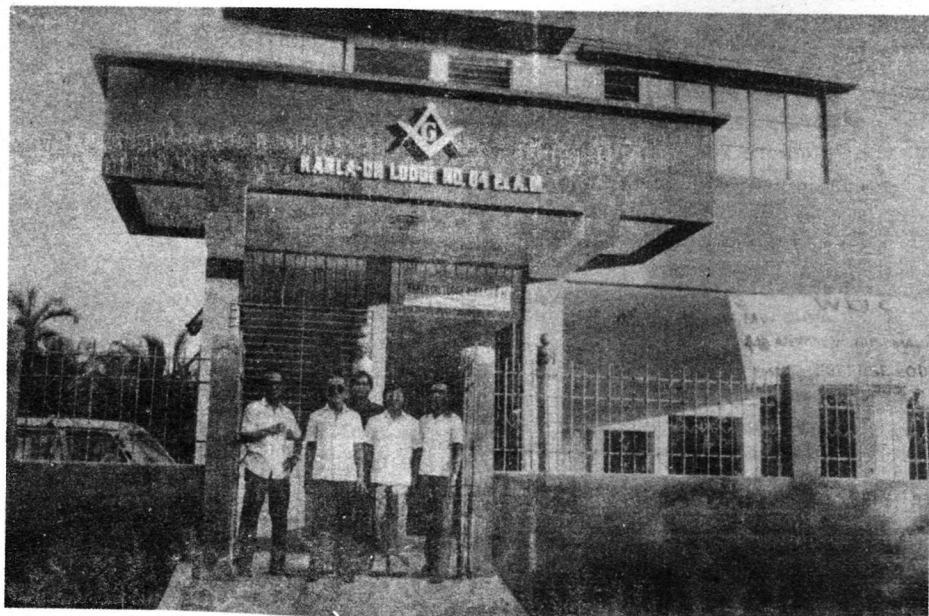
Shown above is the new lodge hall of Kanla-on Lodge.