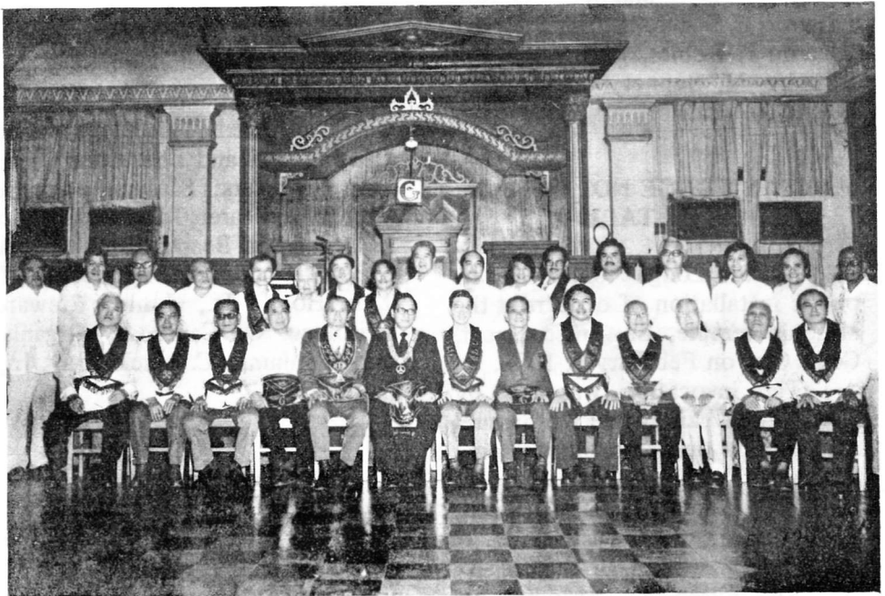
1978 OFFICERS OF MAKTAN LODGE NO. 30 IN CEBU CITY.