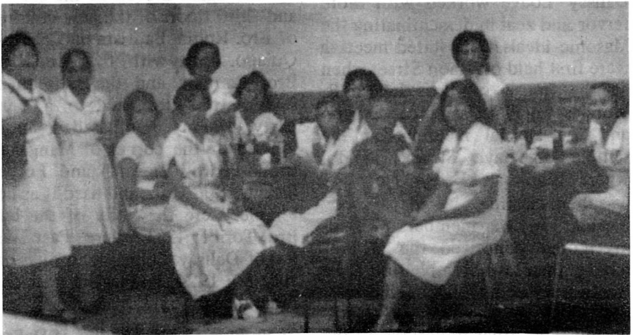
THE LADIES OF THE DELEGATES OF VICTORY LODGE NO. 196 POSE FOR A SOUVENIR PICTURE.