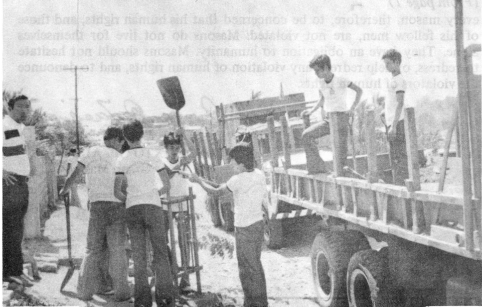
MEMBERS OF THE ISAGANI CHAPTER, 10DM PLANTING TREES