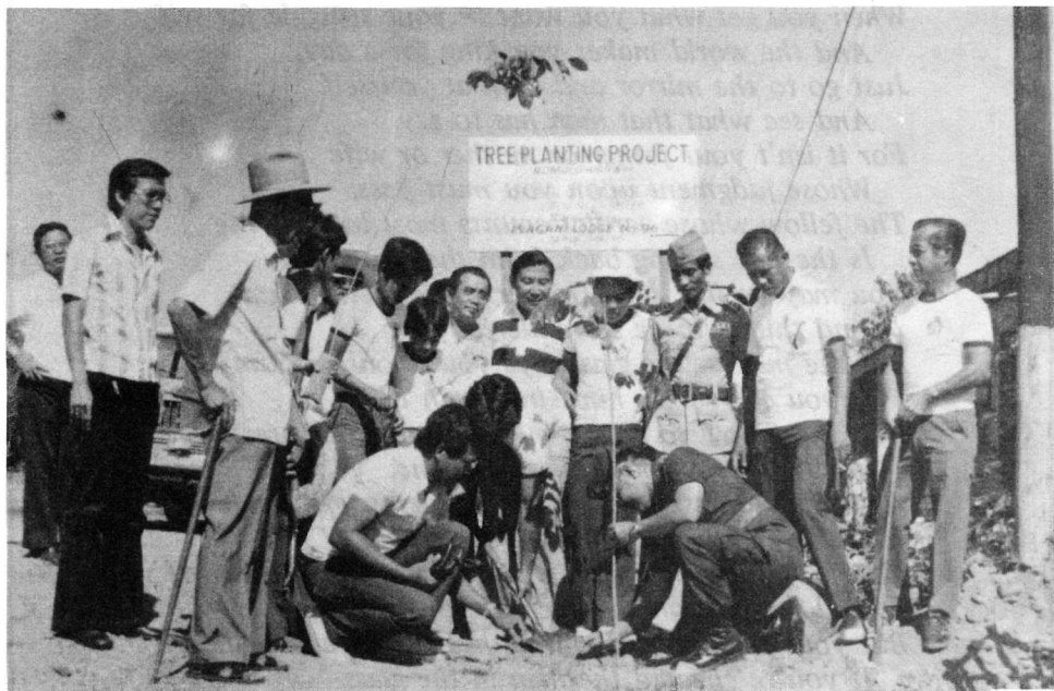
A MEMBER OF THE ARMED FORCES ASSISTING IN THE TREE PLANTING