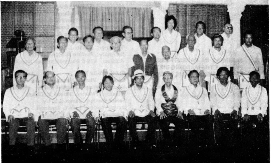
OFFICERS OF KASILAWAN LODGE NO. 79