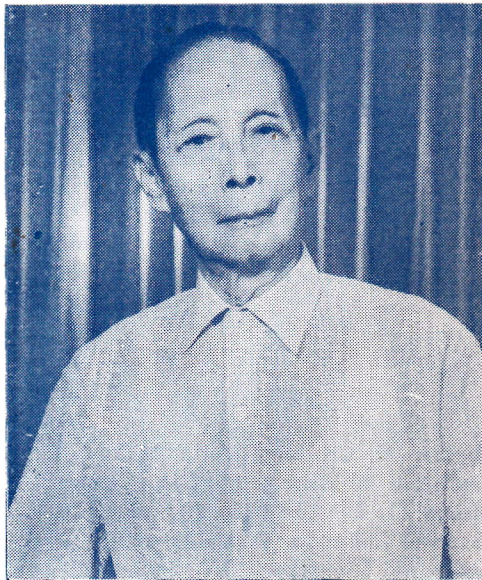
WB ROMAN KAMAToy

OFFICIAL ORGAN OF THE GRAND LODGE OF THE PHILIPPINES