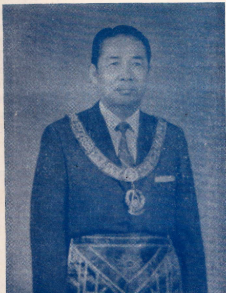
MW DAMASO C. TRIAS Grand Master 1971-72

OFFICIAL ORGAN OF THE GRAND LODGE OF THE PHILIPPINES