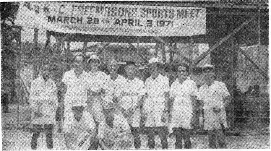
Freemasons and Knight of Columbus racquet wielders.