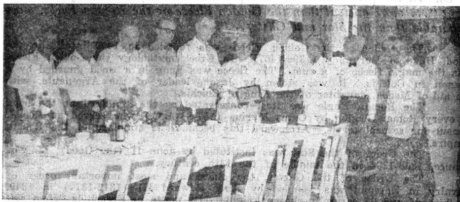
Saigon Oasis officers donate to Masonic Hospital for Crippled Children.

— The Sulu Star, March 27, 1971 issue Page 6