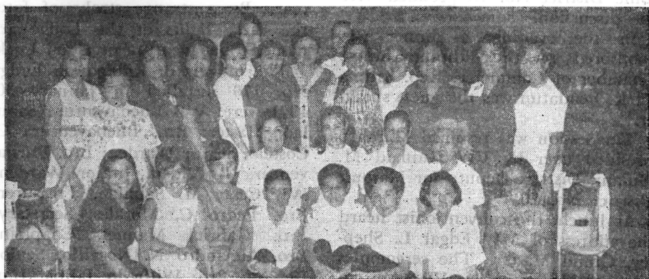
Members of the Order of the Eastern Star and Damas de Isabela pose for the camera before the bowling tournament.