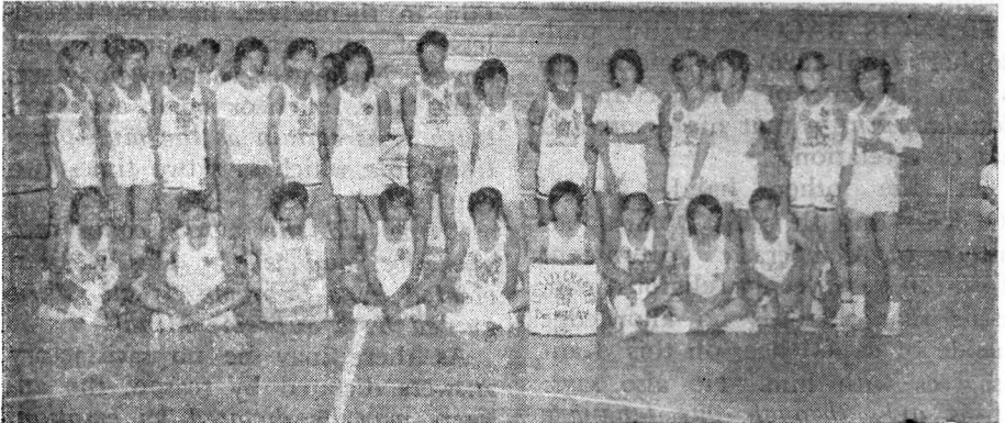
Members of the Capitol Council 3695 Columbian Squires and Loyalty Chapter, International Order of DeMolay basketball team.