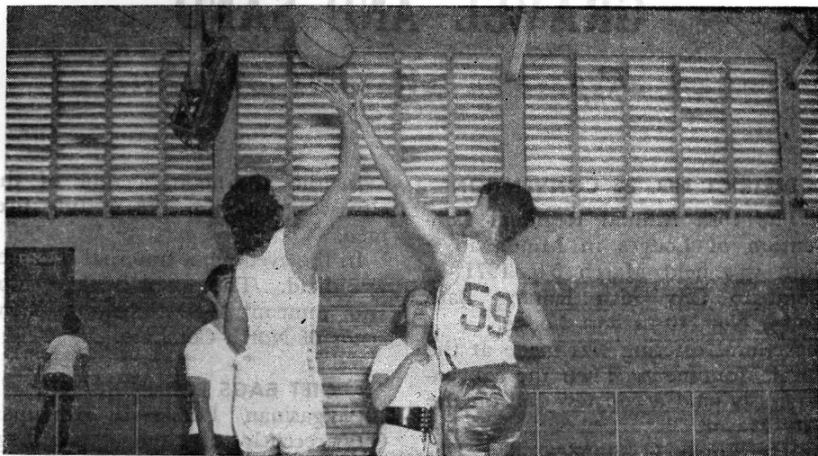
The muse of the Columbian Squires is seen tossing the ball during the opening ceremonies held last Saturday, April 3, 1971 at 3:00 p.m. at the Meralco Gym in Ortigas Avenue, Mandaluyong, Rizal.