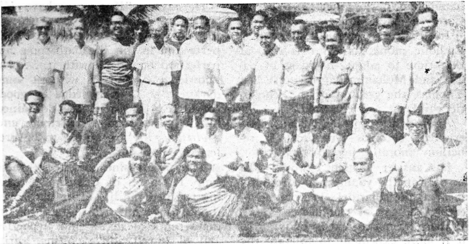
Members of "Aguinaldo Class" in Iloilo with members of the cast of "Aguinaldo Pageant", composed of members of Luzon Bodies, A. & A. S. R.

Cavite Bodies scheduled a Special Conferral to be held on November 21, 1970 at the Bagong Buhay Masonic Temple, Cavite City. * * *