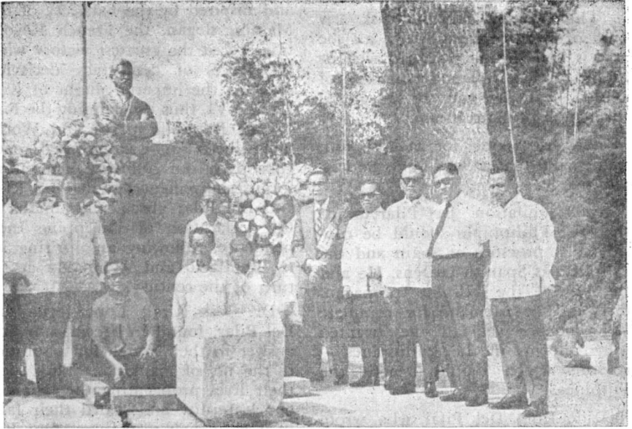
Brethren of Malolos Lodge No. 46 pose in front of the statue of Bro. Marcelo H. del Pilar in Cupang, Bulacan, Bulacan, Aug. 31, 1969.