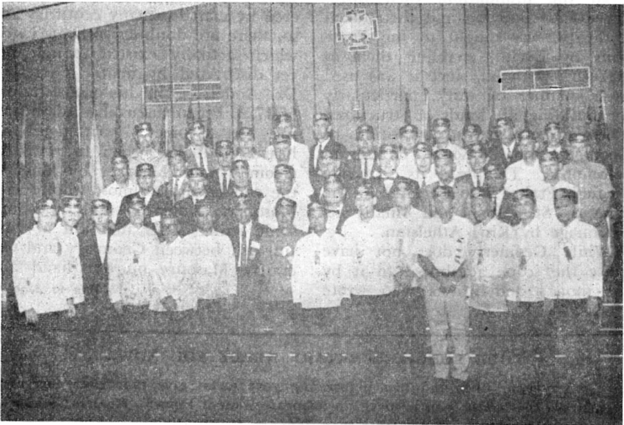
Year-end conferral of Scottish Rite degrees, 4-32, Philippine Bodies, AASR, Plaridel Temple, Oct. 15, 1969. The class of new 32 o Masons was one of their biggest in years.