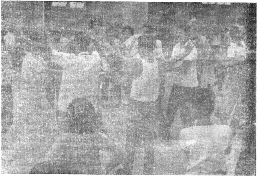
Brethren of Cavite Lodge No. 2, Cavite City, enjoy a game of Tug-o-war in celebration of their 67th anniversary, Oct. 11, 1969.