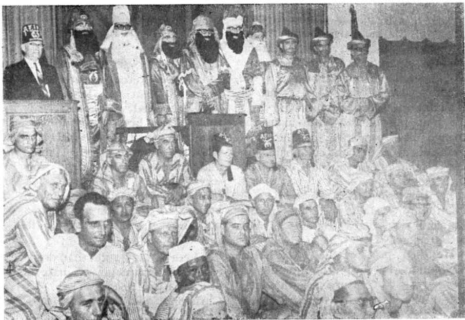
A group of Shrine Neophytes after final ceremonies at Plaridel Temple, Oct. 18, 1969. They are new members of Afiji Temple, AAOONS, Tacoma, Washington.