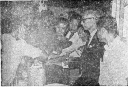
Cavite brethren distributing bayongs of foodstuffs to indigents in Cavite City. This Christmas they will give 600 bayongs.

ay naghahalihalili na magserbisyo, sangayon sa schedule. Ang kahanga-hanga'y mayroon pang mga Doktor na hindi kaanib ay naglilingkod sa klinika. Sa Kabite, ang palakad na ito, ay laganap na. Ang alam na alam naming matagal ng nagliling-