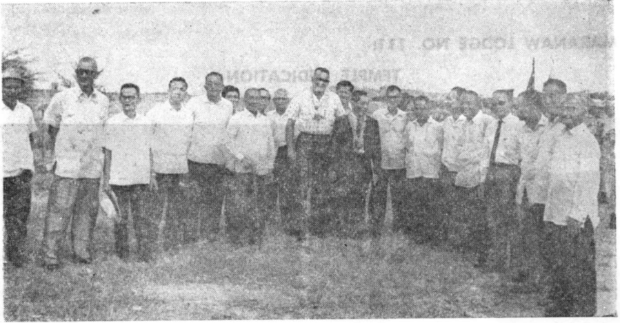
Grand Lodge officers being welcomed by brethren from Bicol Lodges when they arrived for district convention on September 7, 1968.