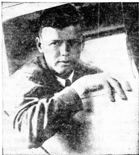
CHARLES A. LINDBERGH

By flying solo from New York to Paris in the "Spirit of St. Louis," in