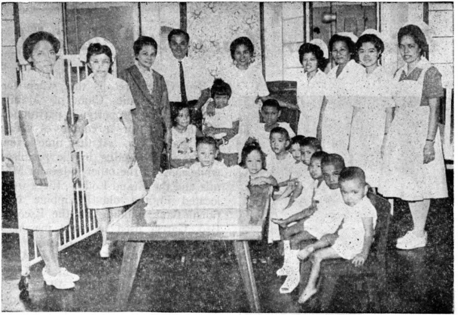
On Christmas Day 1965, the WM, officers and members of Cosmos Lodge No. 8 sent a cake to the children at the Masonic Hospital for Crippled Children.