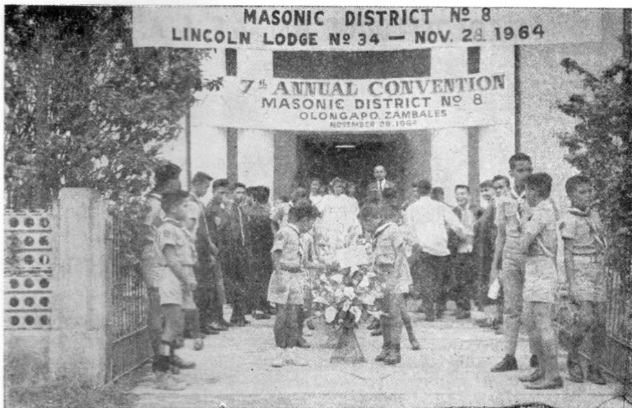
Floral Presentation at District No. 8 Convention November 28, 1964.