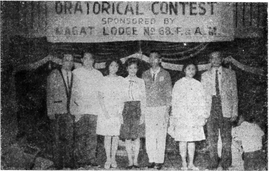
Picture showing the result of the Oratorical Contest winners and officers of Magat Lodge.