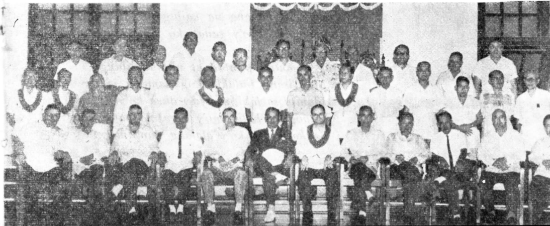
Below: Newly installed officers for 1964 of Cavite Lodge No. 2, Cavite City.