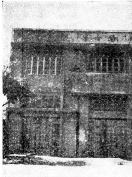
Picture at right is the new temple of Makabugwas Lodge No. 47, Tacloban City.