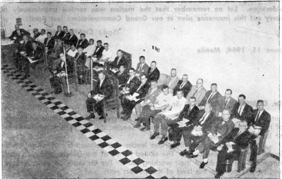
Joint Visitation of Okinawa Lodges