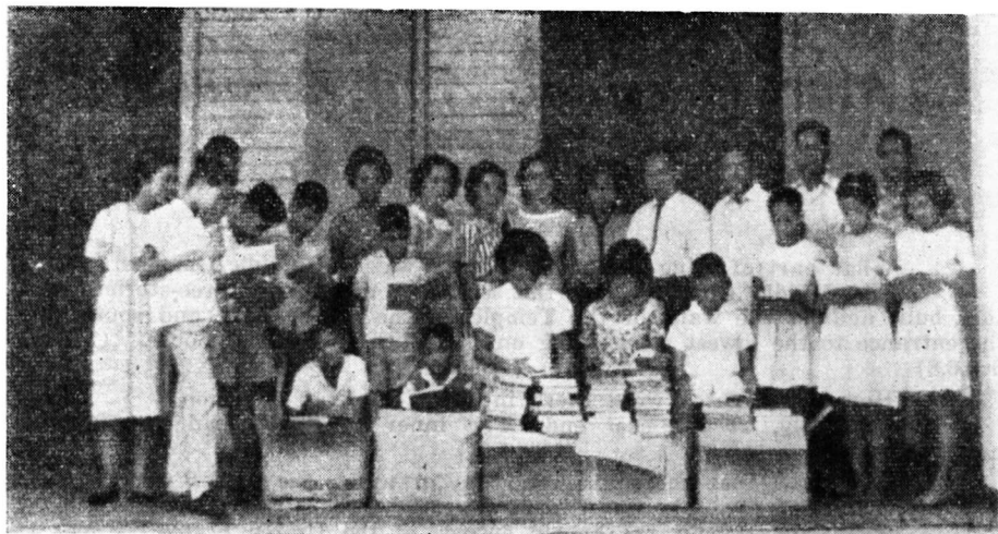
Distribution of school books by Zambales Lodge No. 103, at Iba Pilot School, Iba, Zambales.