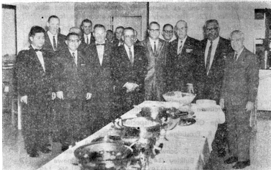
Buffet Dinner before Joint Visitation