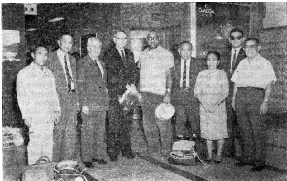
Grand Master and Party is met at Airport