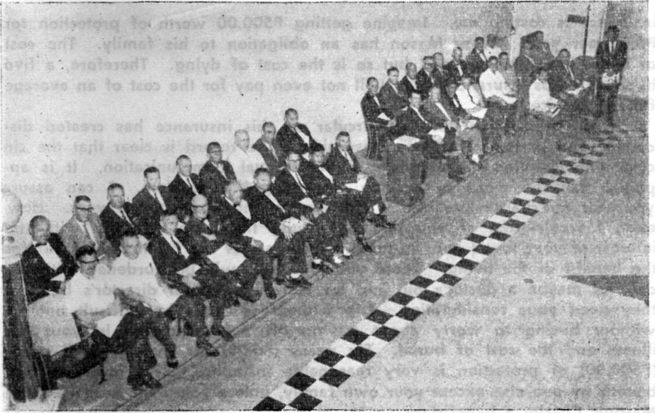
Joint Visitation of Okinawa Lodges