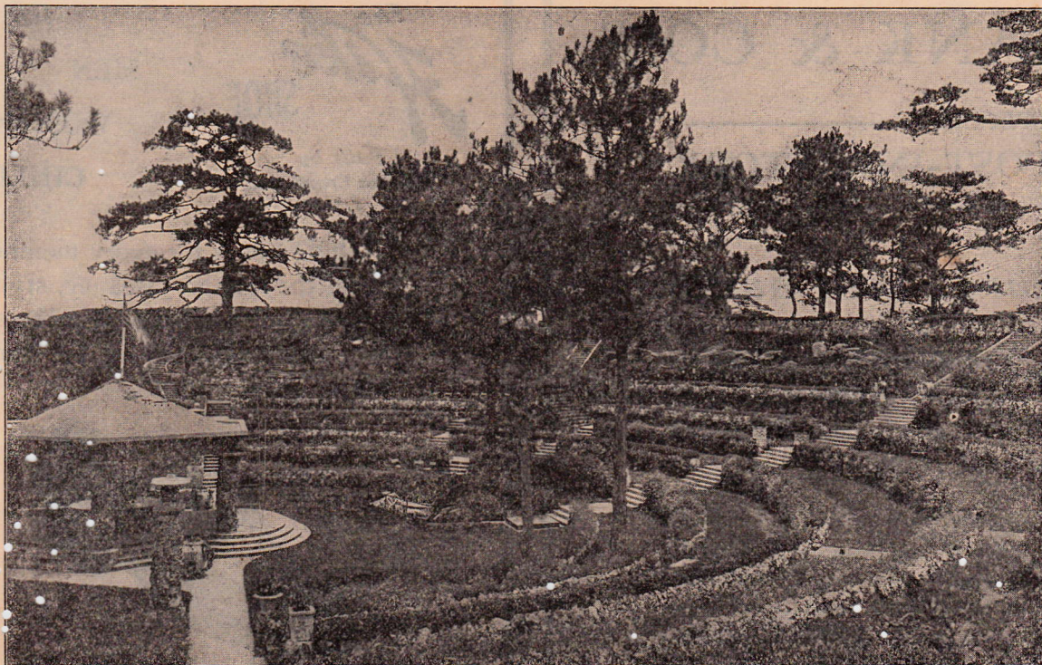
BAGUIO, THE BEAUTIFUL

PUBLISHED FOR AND IN THE INTEREST OF THE MEMBERS OF THE CONSTITUENT LODGES OF THIS JURISDICTION